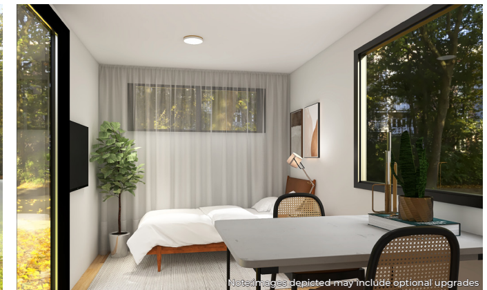
Notes: Images depicted may include optional upgrades